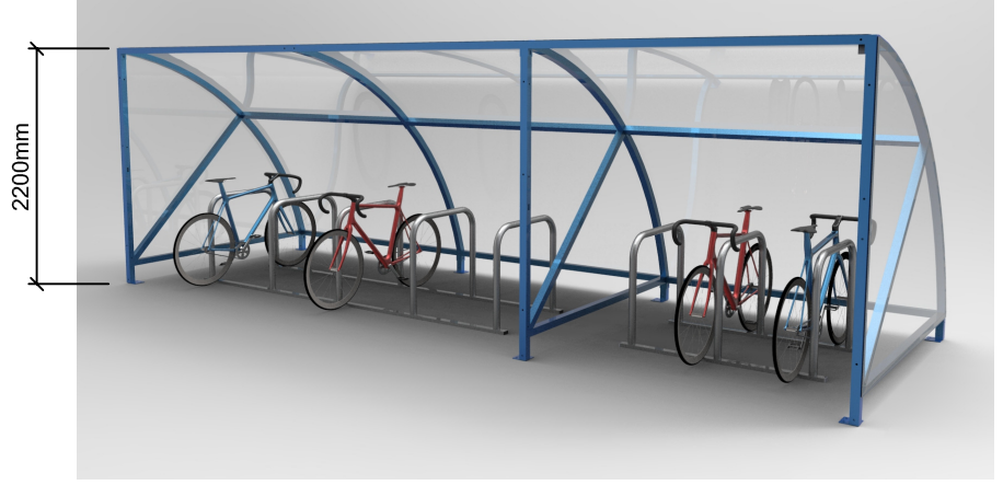
Covered cycle storage illustration - N.T.S (50mm box tube steel frame with polycarbonate roof covering)